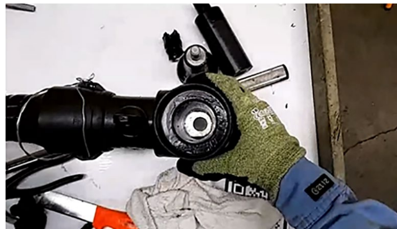
Augmented reality technology gives expert instructors the ability to provide remote trainees with a live, hands-on view of tasks as they are performed.

This pilot project was established to test an instructor-led augmented reality (AR) training system developed by Design Interactive (DI) for use in delivering live training to remote utility workers. XRMentor™ is a cloud-based authoring tool that helps instructors create AR training modules that feature live interaction and incorporate existing training content and resources, such as video, schematics, and 3D CAD models. ClassroomXR™ delivers the instructor-led modules using an off-the shelf AR headset, the Microsoft HoloLens 2. Following the "See One, Do One, Teach One" method, the expert first demonstrates a task in a live-streamed training session while attendees watch and interact. After, attendees can perform the task themselves using how-to guides and other resources and use video collaboration features to connect with the instructor to confirm task completion or make corrections.