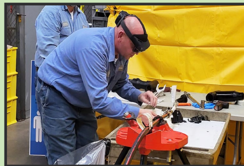
Expert instructors live-stream training from the HoloLens 2 through ClassroomXR.

Generally, about 40 to 60 hours of development time are required to create 1 hour of instructor-led training. Two expert utility cable splicers from Con Edison—with no prior experience teaching or with using AR technology or e-learning training development software—were able to learn to use the XRMentor software and the HoloLens 2 such that they were confident enough to schedule and conduct a live-stream ClassroomXR training session after 40 to 80 hours of investment. Considering the need to use a new training technology and novel hardware device, the marginal cost of using DI’s system to develop and