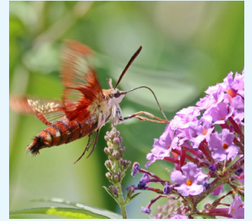
Hummingbird clearwing moths are day fliers

Did you know? There are also many moths whose adult phases don't actually have mouth parts—which means that they don't eat, and hence don't visit flowers, thus aren't considered pollinators.