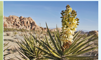
A Yucca moth (left) and its host, the Yucca (right)

4 Butterflies are not a nectar-limited species, meaning it isn't just flowers we should focus on to help their populations. Butterflies also feed on mineral rich soil, tide pools, animal droppings, and urine to gain nutrition.