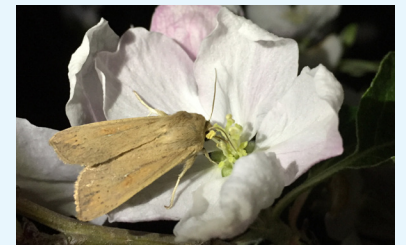
An armyworm moth.

Flowers pollinated by moths are typically very fragrant and lighter in color. These traits allow these flowers to attract moths at night, as the lighter-colored flowers are better at reflecting moonlight.