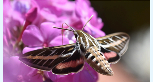
A white-lined sphinx moth

Moths and butterflies belong to the same biological group, Lepidoptera. Globally 180,000 species of Lepidoptera have been described, but considering we discover many new species each year, it's estimated that global species are closer to 300,000 to 500,000. The vast majority of these are moths, as scientists estimate there are ten times more moth species than butterfly species.