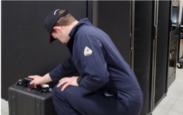
Figure 1. Illustration of IEMI attack on a server rack using a portable weapon